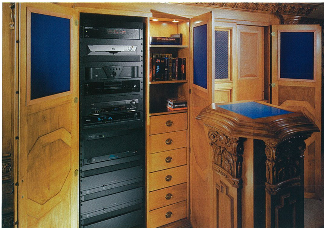
A custom cabinet housing the electronics preserves the magnificent theater's design integrity.

Electronics Design Group, 732.650.9800, www.edgonline.com ; Robert So Designs, 973.667.1290