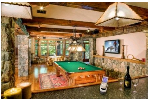
Recreation at its finest

"Polo and Turner have collaborated not only because of their shared desire to celebrate America's great architectural legacy, but also their commitment to incorporate the most sophisticated heating and cooling, smart home and energy saving technologies to create a residence of singular beauty that will be a wonderful place to live and work."