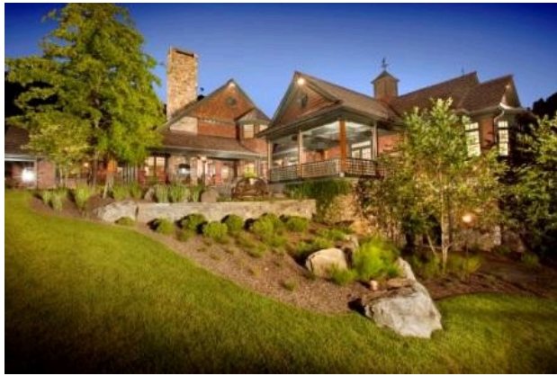
Elegance at twilight