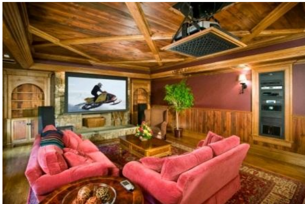
Now you see it...