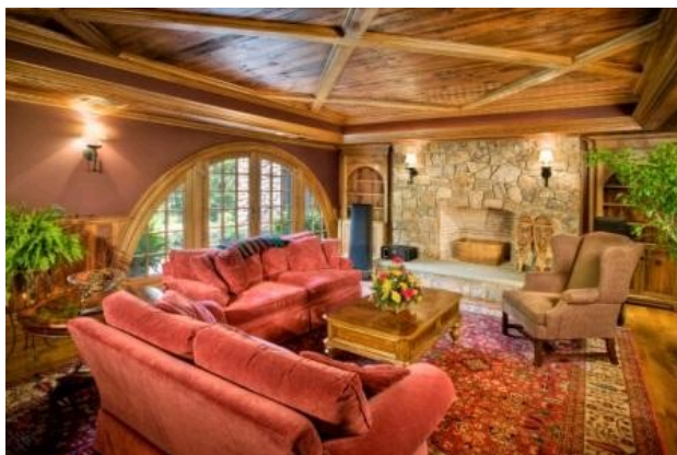
Now you don't